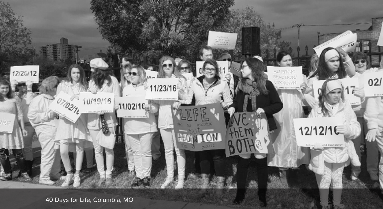
40 Days for Life, Columbia, MO

sending a patient to the hospital every month and a half for eight years. But in the wake of the U.S. Supreme Court’s pro-abortion 2016 decision in Whole Woman’s Health v. Hellerstedt 4 , political dialogue has focused on the issue of “adequate abortion access” within each state, without stopping to ask whether that access comes at a price in women’s safety. A May 23, 2017 article in HBO’s news outlet, Vice , “The Last Clinics,” profiled the seven states in which only one abortion option remains 5 . “Across the country, the number of abortion clinics has been declining for years, and after another clinic closed in West Virginia in January [2017], seven states have just one abortion provider left,” Vice reported. “[W]omen have ever fewer options for care as lawmakers – who cannot ban abortion outright – push ever more restrictions aimed at forcing providers to close.” 3